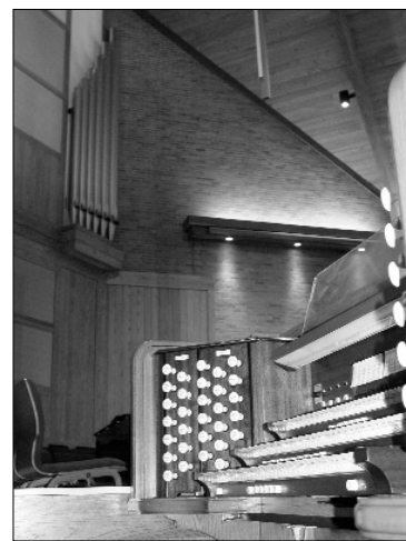
Schantz Organ at Northwest Christian Church